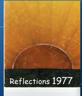
First documented yearbook cover