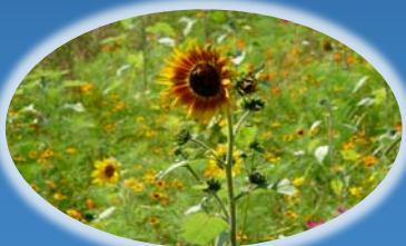
Fields of Flowers on Tempel Farms

Spring MAP Testing in Grades 2-8 - April 7-20