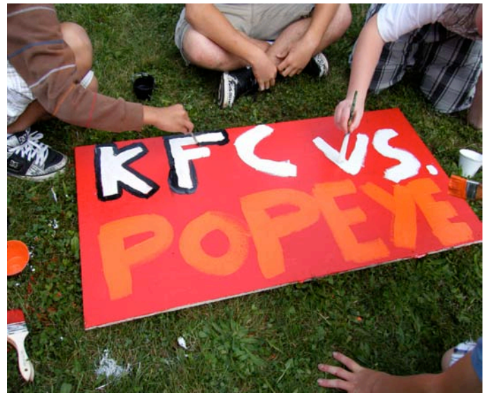
Eighth Graders work on ceiling tile project

I am sure you will not be surprised to hear that we had some excellent discussion and group work during this day. We went over the current research regarding homework at the elementary grades vs. high school. If you are interested in this topic and we have piqued your curiosity, please feel free to ask any of us about this or go to www.homeworklady.com for more information. You may be surprised at the information you find there!